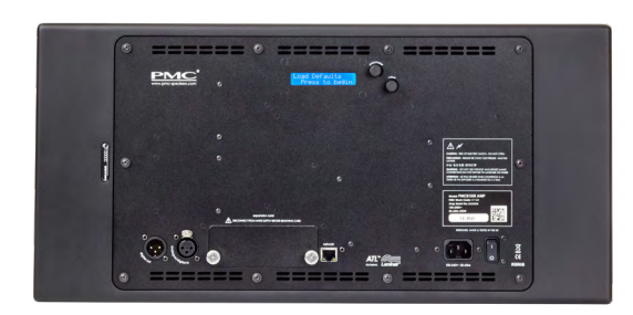
PMC8 SUB rear panel